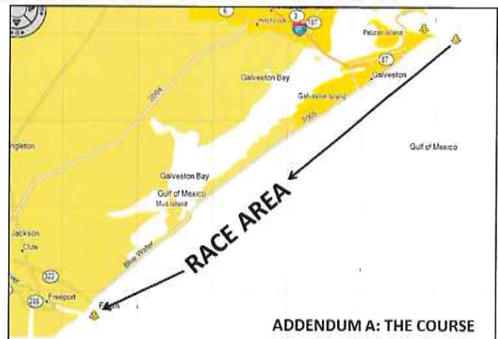
ADDENDUM A: THE COURSE